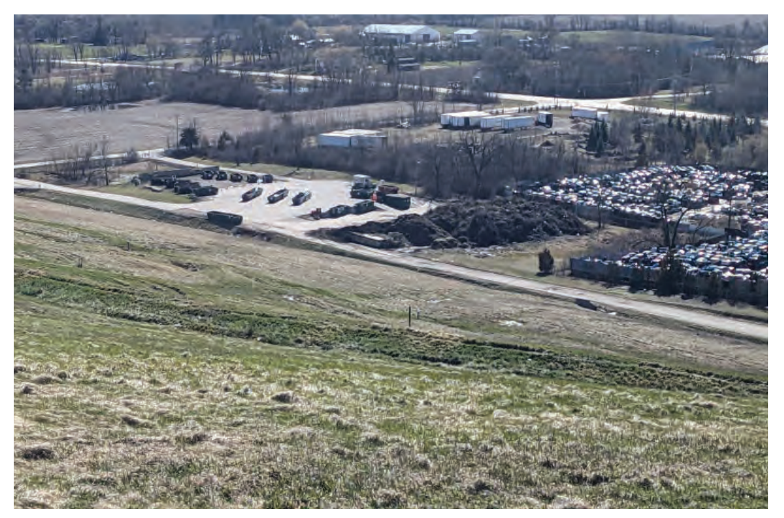
Resi-drop-off; site cleaned