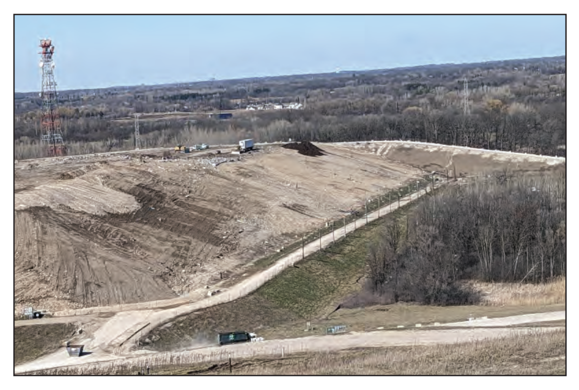
East slope of North Expansion West, fully coveredf in intermediate cover