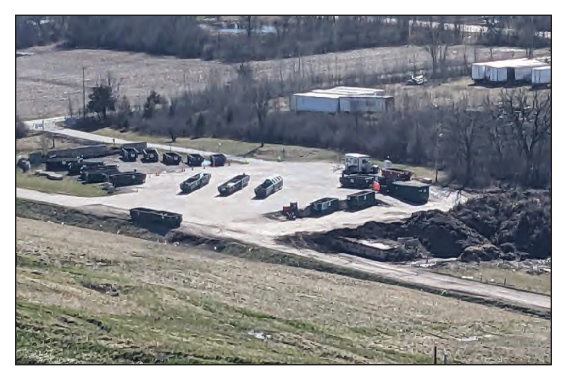
Resi-drop-off; boxes emptied