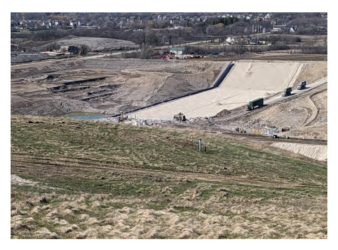
Phase 3 receiving waste. Select waste fluff layer being placed in Southeast corner