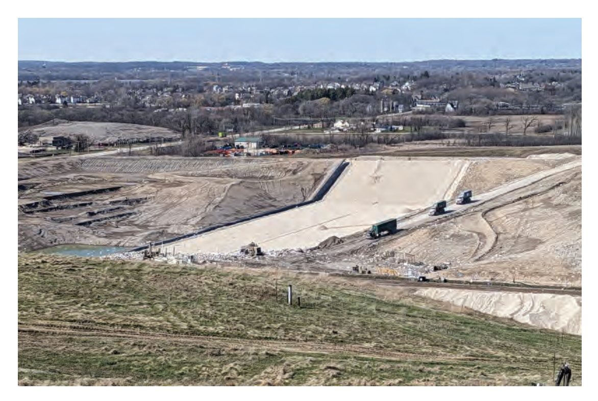
Phase 3 receiving waste. Select waste fluff layer being placed in Southeast corner