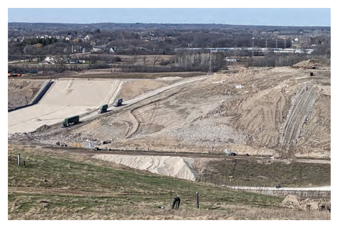
Access to new cell around Phases 1 & 2; receiving fluff layer