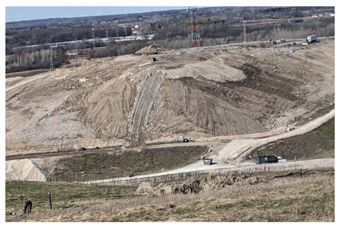
South slope of North Expansion West, fully coveredf in intermediate cover